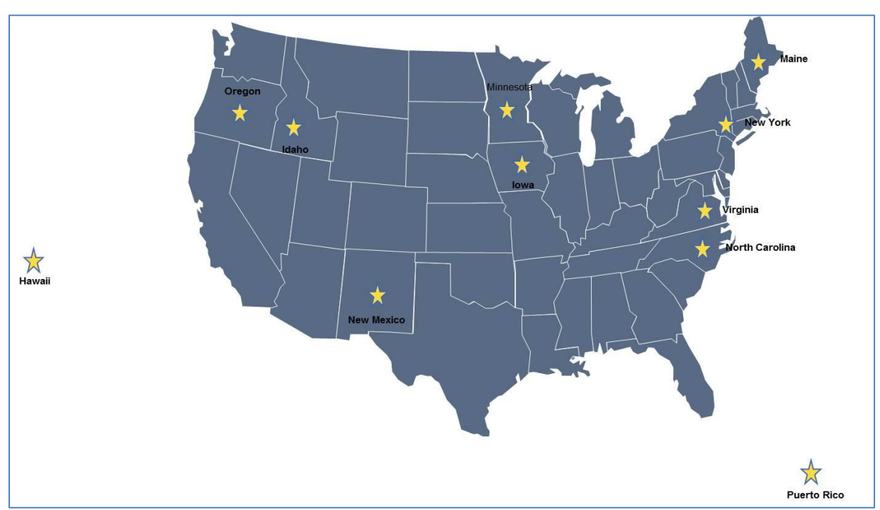
Figure 1 – Consumer Access to Immunization Information Participant Jurisdictions

A critical element for identifying, documenting, confirming, and promoting the anticipated consumer access promising practices is soliciting, disseminating, and cataloging stakeholder input from IIS users and other key stakeholders that have expressed interest in IIS consumer access. The Deloitte team worked with ONC public health leadership to identify key stakeholders to develop a clear representation of IIS consumer access perspectives. Through this initiative, several state and territorial IIS representatives, the ONC, and the American Immunization Registry Association (AIRA) are investigating the opportunity for consumer access to their immunization registration data in support of Federal consumer health data initiatives. Figure 1 shows the jurisdictions that are represented as participants in this initiative.